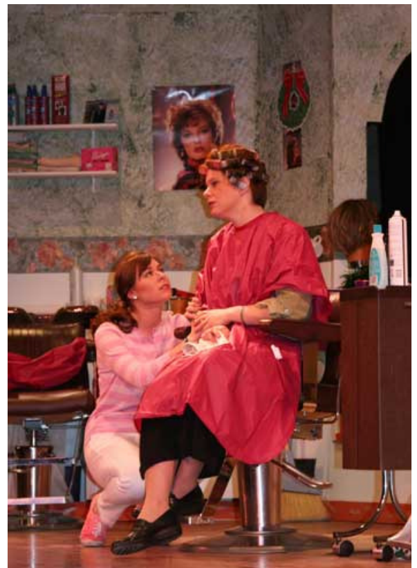
Steel Magnolias - Feb 2005